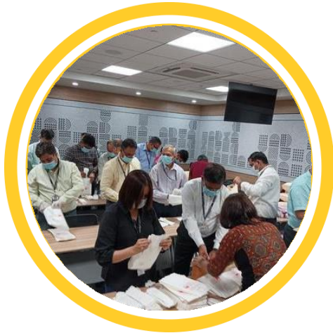
Indoor (Company Premises)