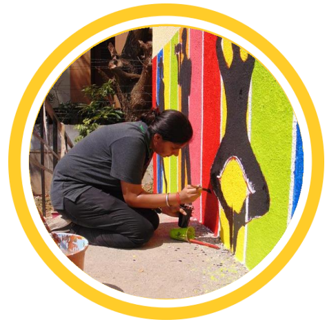
Outdoor (On Field)