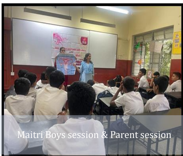
Maitri Boys session & Parent session