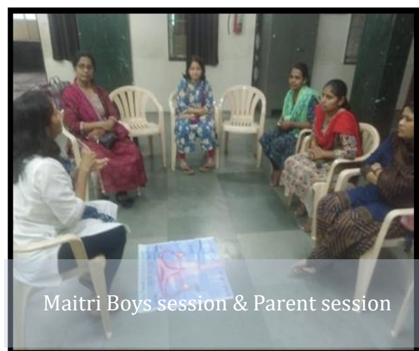
Maitri Boys session & Parent session