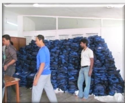
Final Assembly Of School Bag