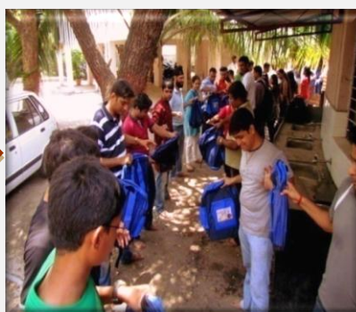
Transfer of kits to storage