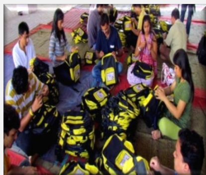
Quality Check Of School Bag

We started our School Kit Assembly on Sunday 1 st May 2011 wherein around 300 volunteers came together including volunteer from corporate, students, small kids, seniors and other individuals . School Kit Assembly Program was conducted on every Sunday starting from 1 st May 2011, total of 10 Sundays including few Saturdays also with average of 200 volunteers on every drive. All the volunteers despite of different class group assembled together for this cause. The environment at assembly venue, was always with full of zest & sincerity towards the work.