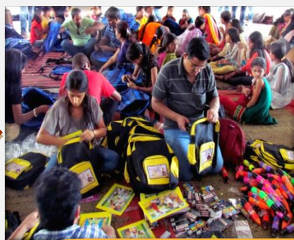
Inserting Material In School Bag