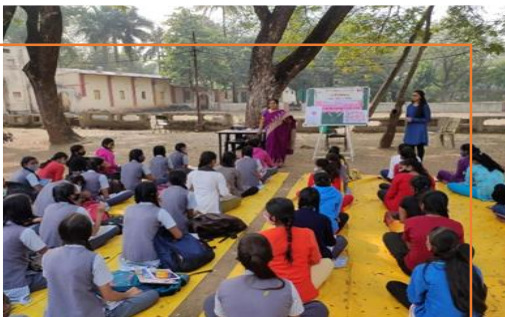
Vidyapeeth High school