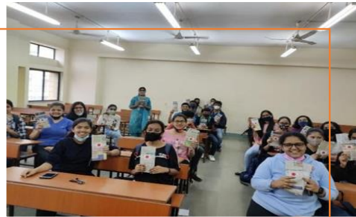
Kalmadi High school