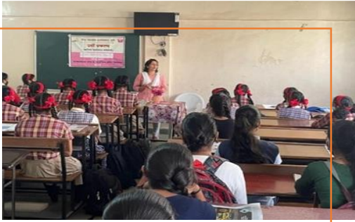
Rambhau Mhalgi School