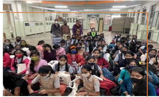
Erandawana Madhaymik Vidyalay