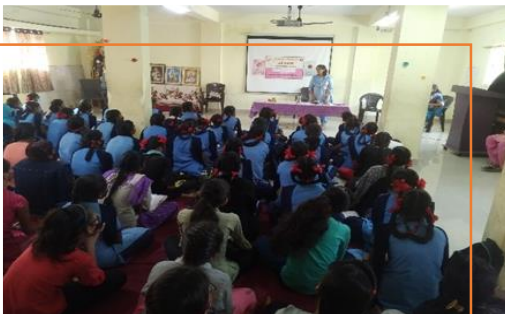
Lokmany Tilak Vidyalay, Wakad