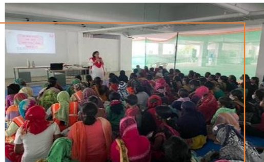
Mega police Construction workers