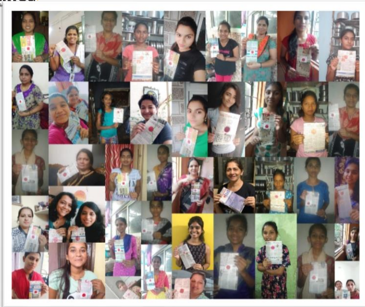
Selfies by Volunteers for participating in Red Dot Bag Activity from their homes on Menstrual Hygiene Day.