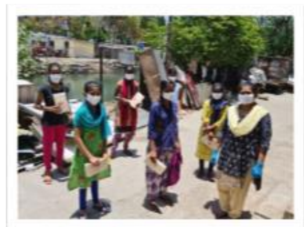
Distribution of Sanitary Napkins while following Social Distancing